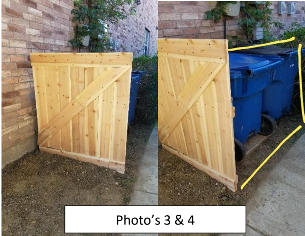
Photo's 3 & 4